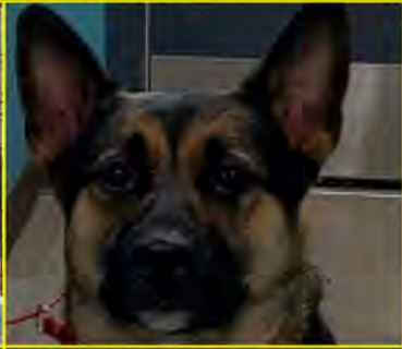
JACK Shepherd mix adult M