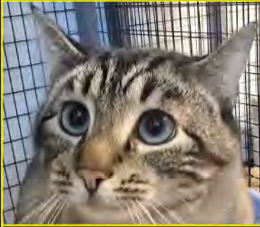
LINK SH grey tabby adult M