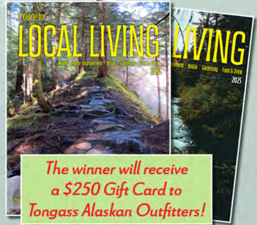
Photo contest winners will be announced in our April 29th issue of The Local Paper.

The winner will receive a $250 Gift Card to Tongass Alaskan Outfitters!