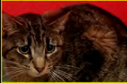
JASPER SH tabby adult M

People who say "Money Cannot Buy Happiness" have never paid an adoption fee.