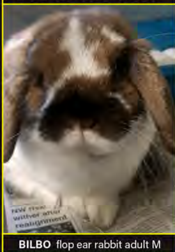
BILBO flop ear rabbit adult M