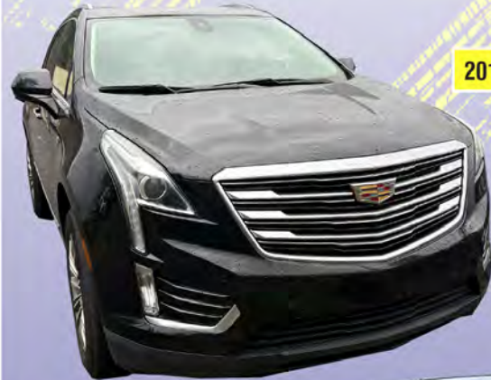
2018 CADILLAC XT5