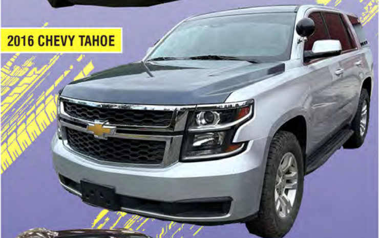
2016 CHEVY TAHOE