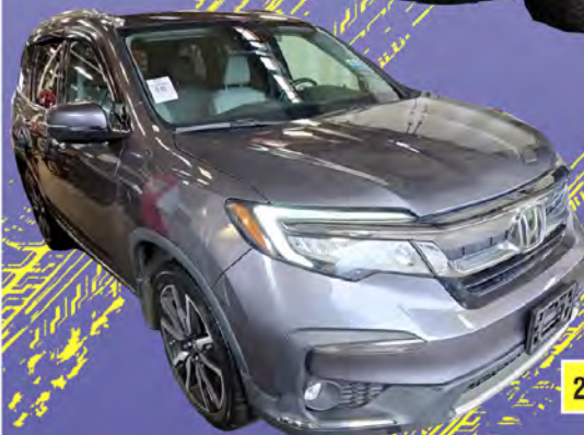
2019 HONDA PILOT