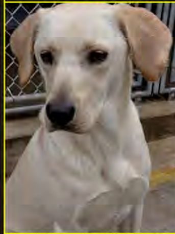
ASHER golden Lab young M