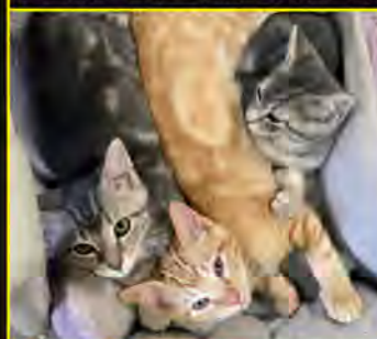
KITTENS assorted colors