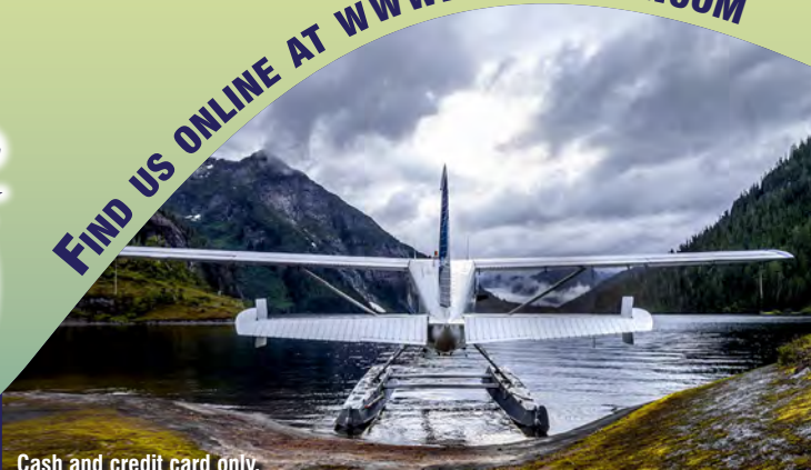
Cash and credit card only.

FOLLOW US ON FACEBOOK FOR MONTHLY SPECIALS OR CALL 907-225-8800