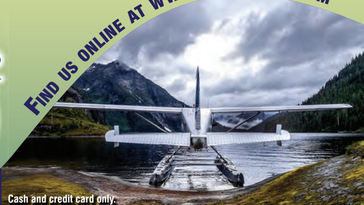
Cash and credit card only.

FOLLOW US ON FACEBOOK FOR MONTHLY SPECIALS OR CALL 907-225-8800