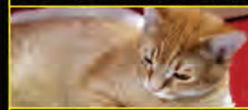
SCOTTY orange tabby adult M