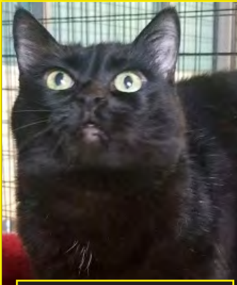
ARTEMIS SH black adult F

PUMPKIN black Lab mix adult F COLE Lab mix black adult M ANDRINA Terrier mix puppy F OTIS Lab mix black adult M SHILO Lab mix adult M LOKI Lab mix adult M